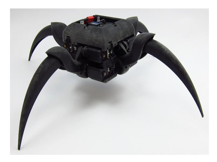
Figure 1: Aracna: an open-source 3D printed quadruped robot platform, here printed in a black rapid prototyping polymer. STL files for 3D printing the robot and drivers for the Arbotix board and servos are publicly available at http://creativemachines.cornell.edu/aracna.

produced gaits that outperformed those designed by a human engineer (Yosinski et al., 2011; Hornby et al., 2005), which is not surprising given that evolutionary algorithms routinely create solutions that are superior to manually created solutions (Koza, 2003).