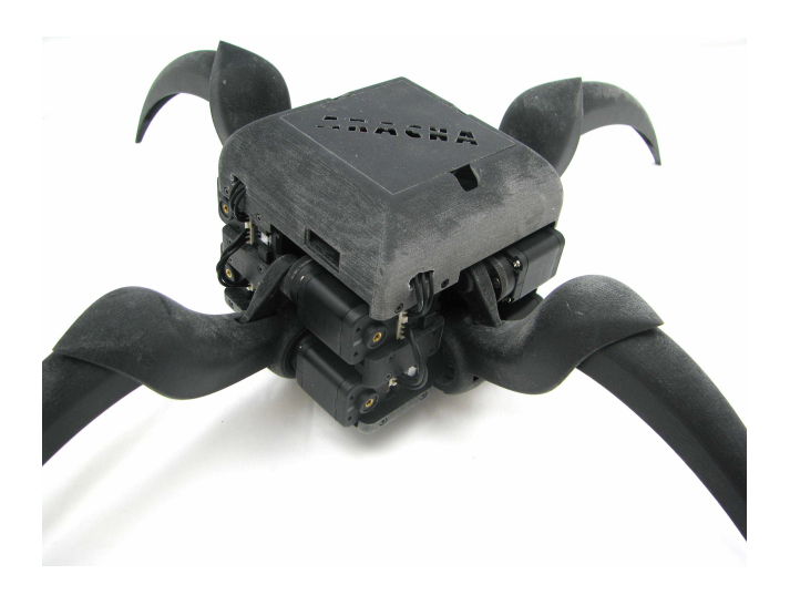
Figure 7: Aracna with optional top cover.

that humans find hard to program solutions for. The reason Aracna's kinematics are counter-intuitive is because there is a nonlinear mapping between each servo's output and the movement of the joint controlled by that servo.