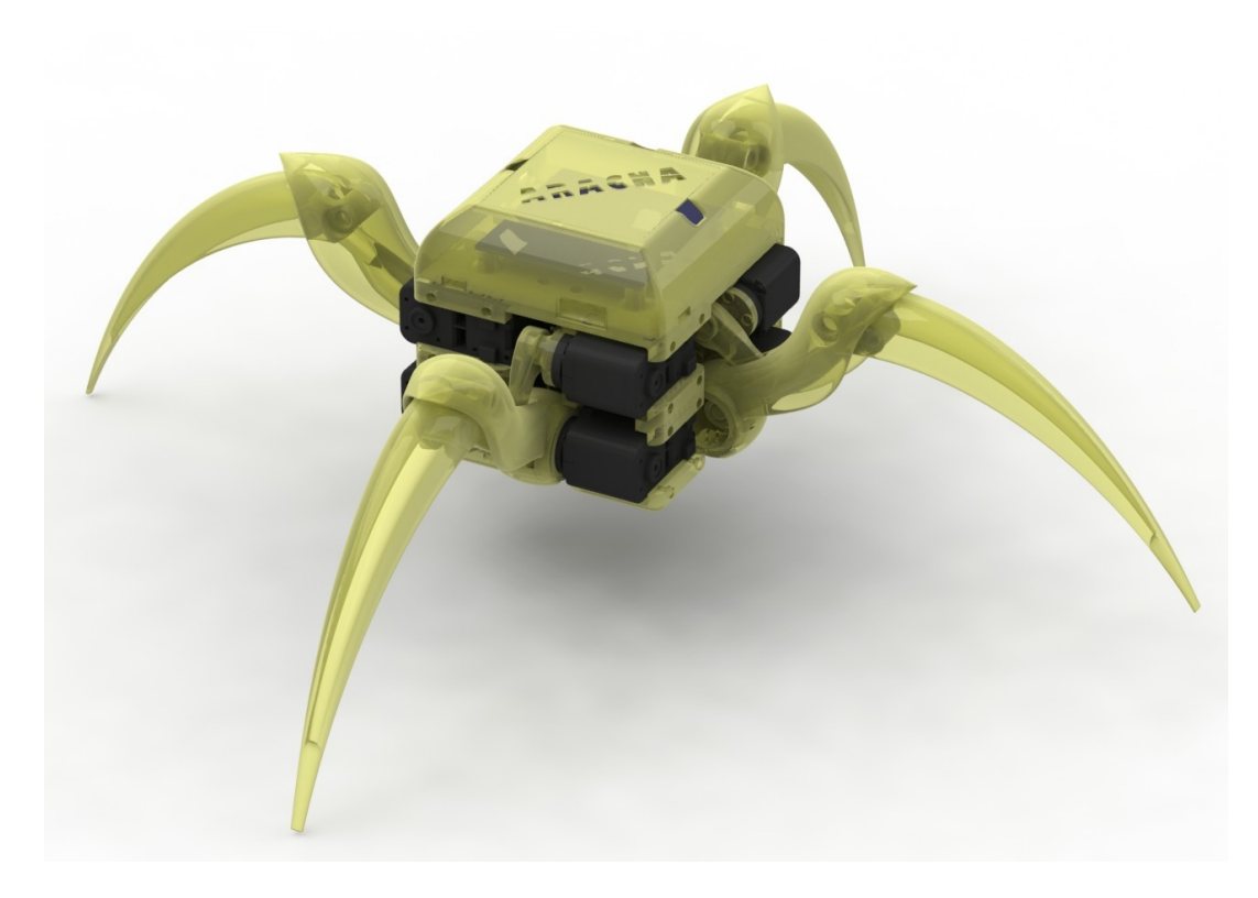
Figure 2: A rendered CAD model of Aracna. Note the lack of heavy servos on the legs themselves, which are instead controlled via four-bar linkages by servos in the robot's core.