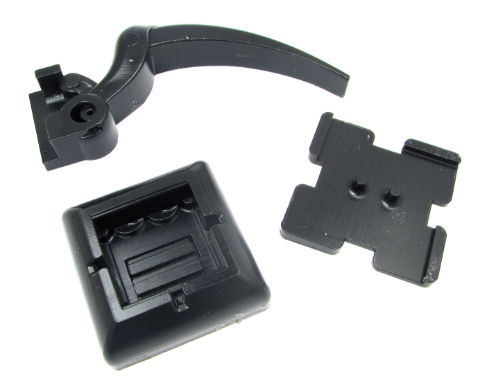
Figure 6: A final version of Aracna printed in multiple pieces. The body is printed as two pieces, with 9 smaller parts within the top piece to reduce support material and print time. These parts can be printed individually if replacements are necessary. The body consists of a total of 11 parts. This image shows a set of 12 printed parts (the complete body and a single leg) with support material still present.