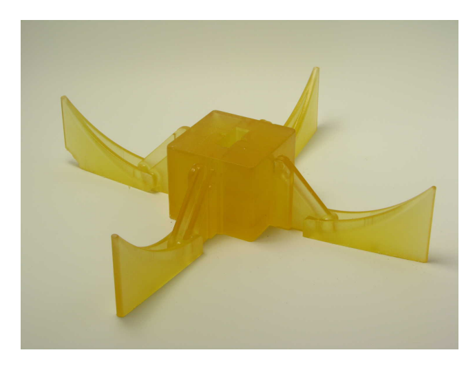
Figure 5: A draft version of Aracna that was printed in one piece. This monolithic design proved expensive to maintain if part of the robot was damaged, and was replaced in a later version with a modular design. This figure shows the printed body with support material still present.

on Aracna's use of approximately 967g of model material and 746g of support material, and current material costs of 4.5g per USD and 8g per USD for rigid and support material, respectively. This cost estimate is variable depending on the type of material used. The print times are estimates calculated by the Objet's software and are meant to be used as a relative comparison of print times. Table 1 outlines the total estimated cost of Aracna, which is just under $1,400, including its off-the-shelf electronic components.